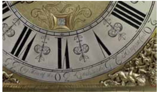
Fig. 3. The signature on the chapter ring reads: 'Coy Man of the Leach Tho Hampson fecit'.