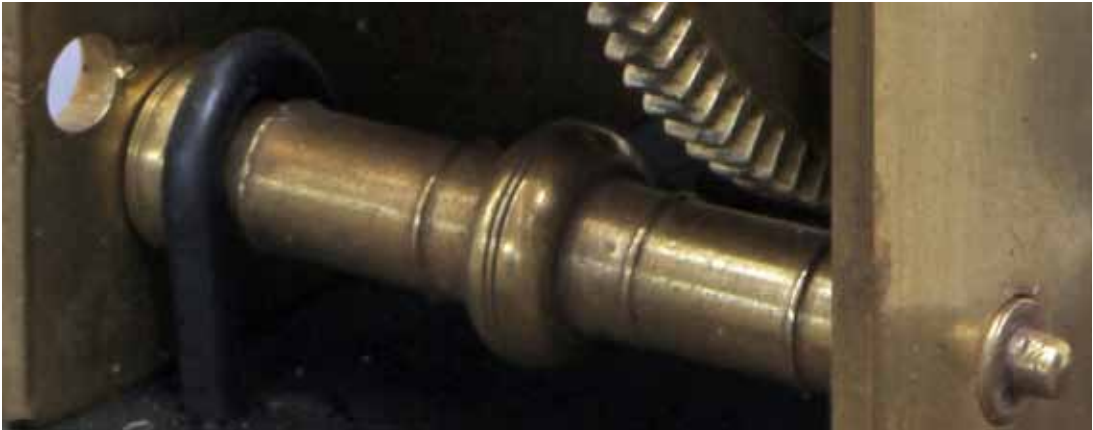
Fig. 8. The four finely fluted pillars with ringed knobs are screwed into the backplate – the pillar extensions on view from the back, are also ringed.