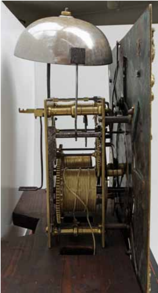
Fig. 6. The movement from the strike side showing the strike/silent lever reaching up to the top of the dial.

Unlike the majority of his clocks made whilst he was in Wrexham, this clock was not numbered by Thomas Hampson. It is not known whether Chester-made longcase clocks like the one illustrated in the Miller's Guide, or the one auctioned at Sotheby's, were numbered. In neither case was numbering mentioned in the items' descriptions. Linnard has listed the numbers which have been traced; the lowest, and presumably the earliest, is number nine; it was made in Wrexham. 20 If the Chester-made clocks were included in the numbering system