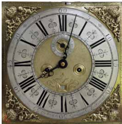
Fig. 1. The 12¾ inch dial is finely matted, has ringed winding holes and well balanced engraving around the date aperture. It is bordered with leaf motifs rather than the more usual wheatear engraving. The chapter ring is beautifully engraved with ebullient half hour markers and only two starburst half quarters, (owing to the length of the signature).

Linnard estimated that as many as 1600 clocks were made in the Hampson workshop during his thirty-five year working life, but of