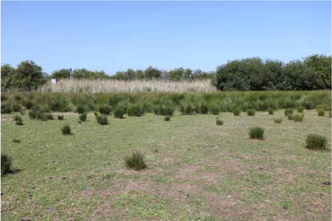
Fig. 4. Looking toward the Wrexham–Chester railway line which is obscured by the area of pale, tall reeds. Only half of the decoy has been visible from this direction since the construction of the line. The low lying area extends further to the left and right of this shot and the land slopes away gently from the camera. The outline of the decoy is visible from the air. We visited the site during a prolonged dry spell of weather; this land frequently floods after heavy rainfall.

unusual location description was made, the decoy was owned by James Mainwaring. A decoy could be a significant business, 16 and perhaps he commissioned Thomas Hampson to make the clock for the coy man's house?